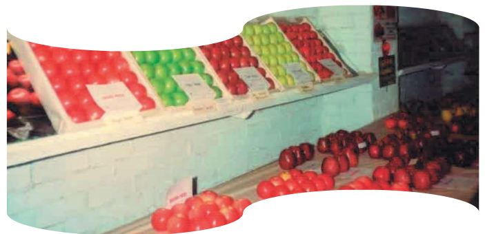
PLATE OR BOWL OF APPLES